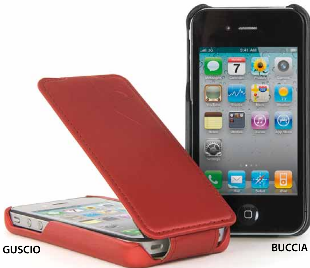
GUSCIO [cod. IPHG]